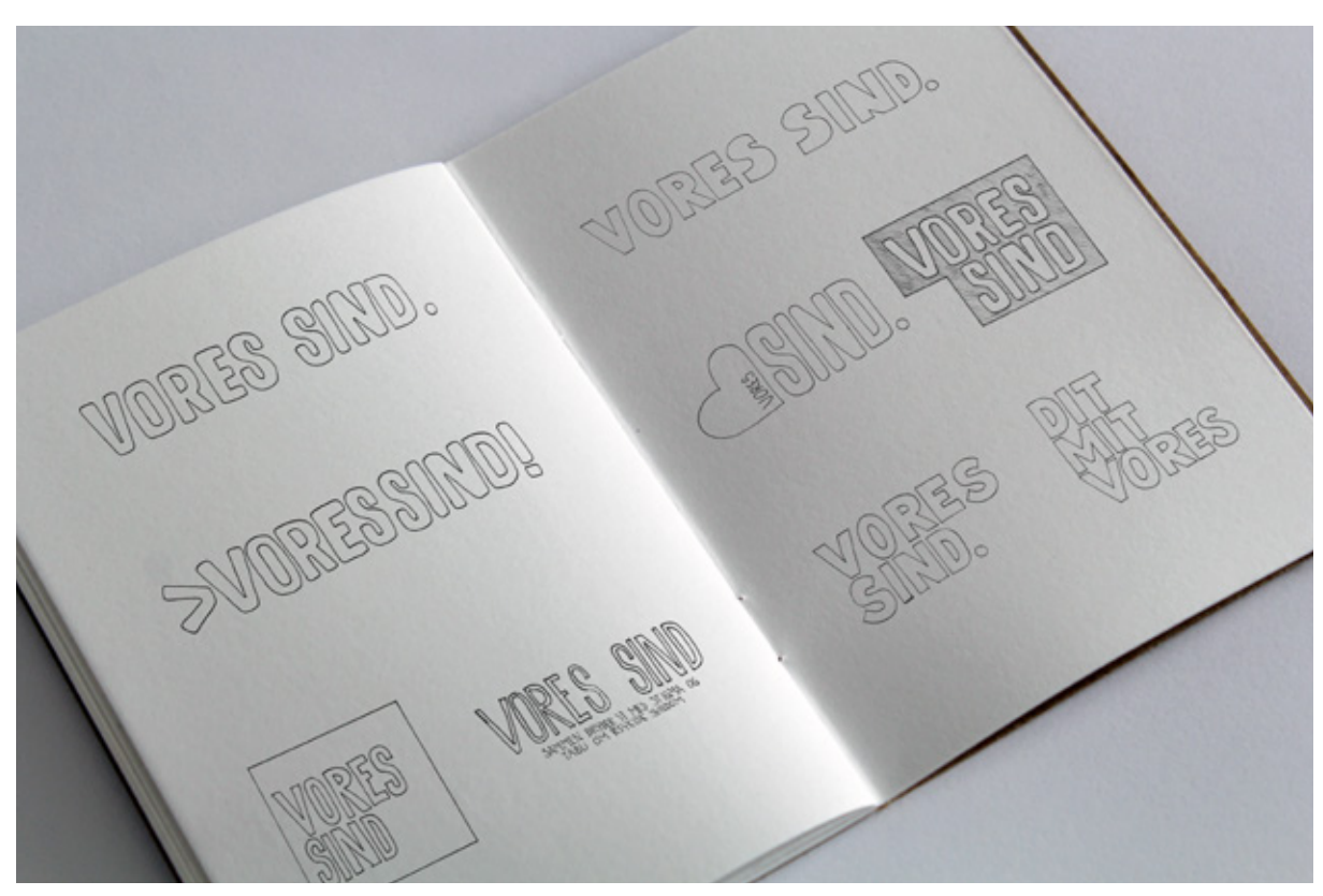
7.3 Logo Proces7.3.1 Logo sketches