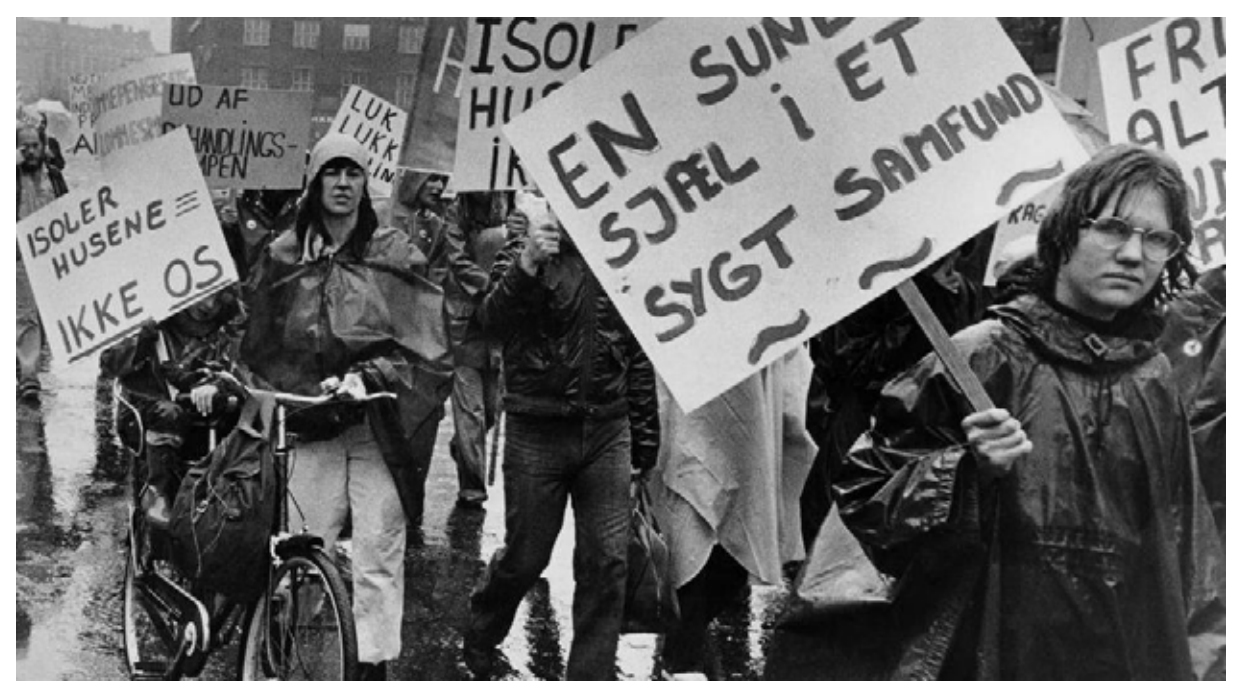
The picture shows an undated festival.

Galebevægelsen can be seen as an expression of a massive desire to change psychiatry. Society's views of people with mental challenges changed and the movement still exists to some extent today among those who are critical of society's way of dealing with mental illness. Although the movement started back in 1979, some of their concerns are still very relevant to this day e.g. the problem and the dissatisfaction about how society views people with mental illness. Galebevægelsen came to be the initial start of many of the organizations we see today as example SIND, Psykiatrifonden and LAP – Landsforeningen Af Psykiatribrugere.