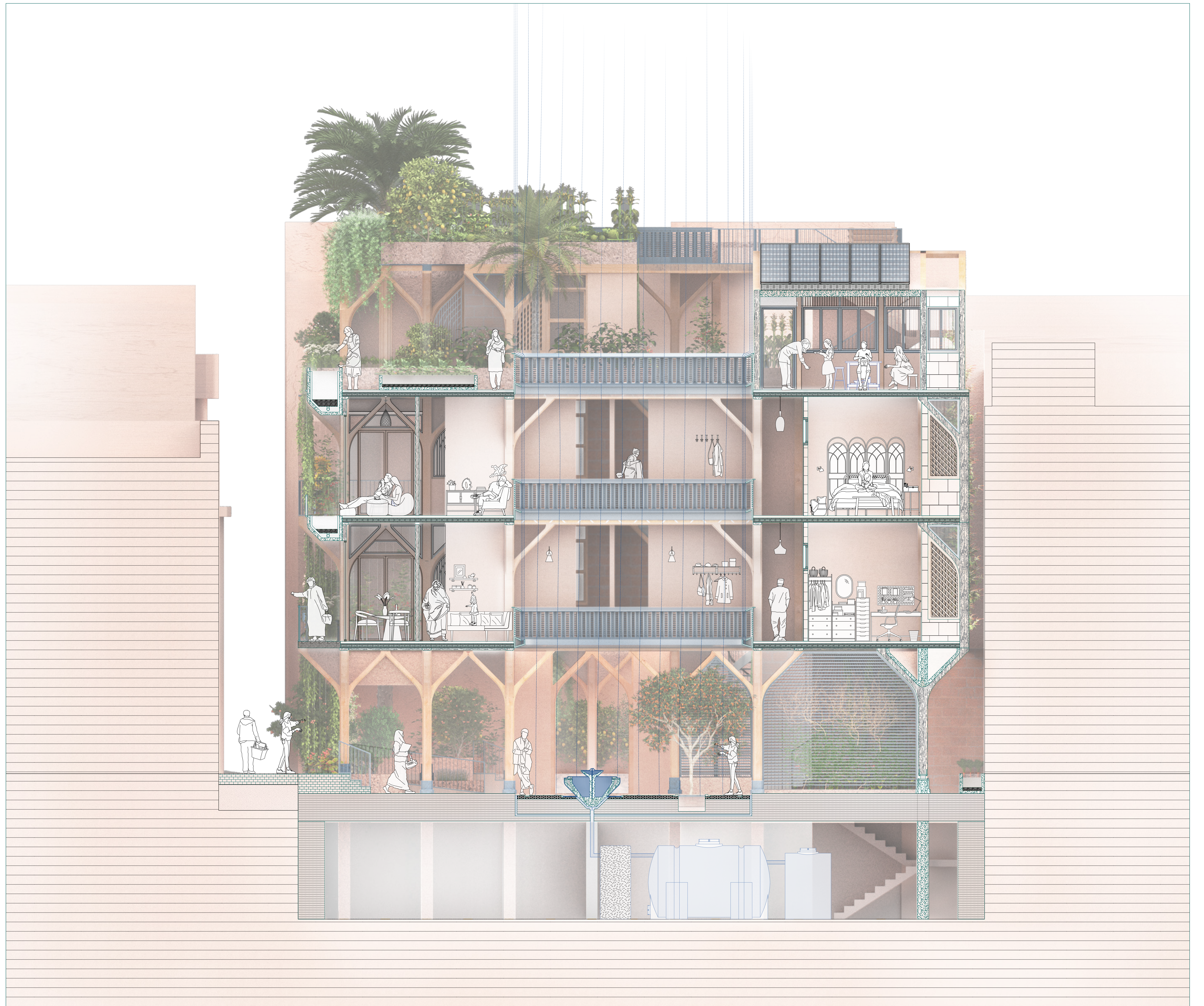
SECTION B SCALE 1/50