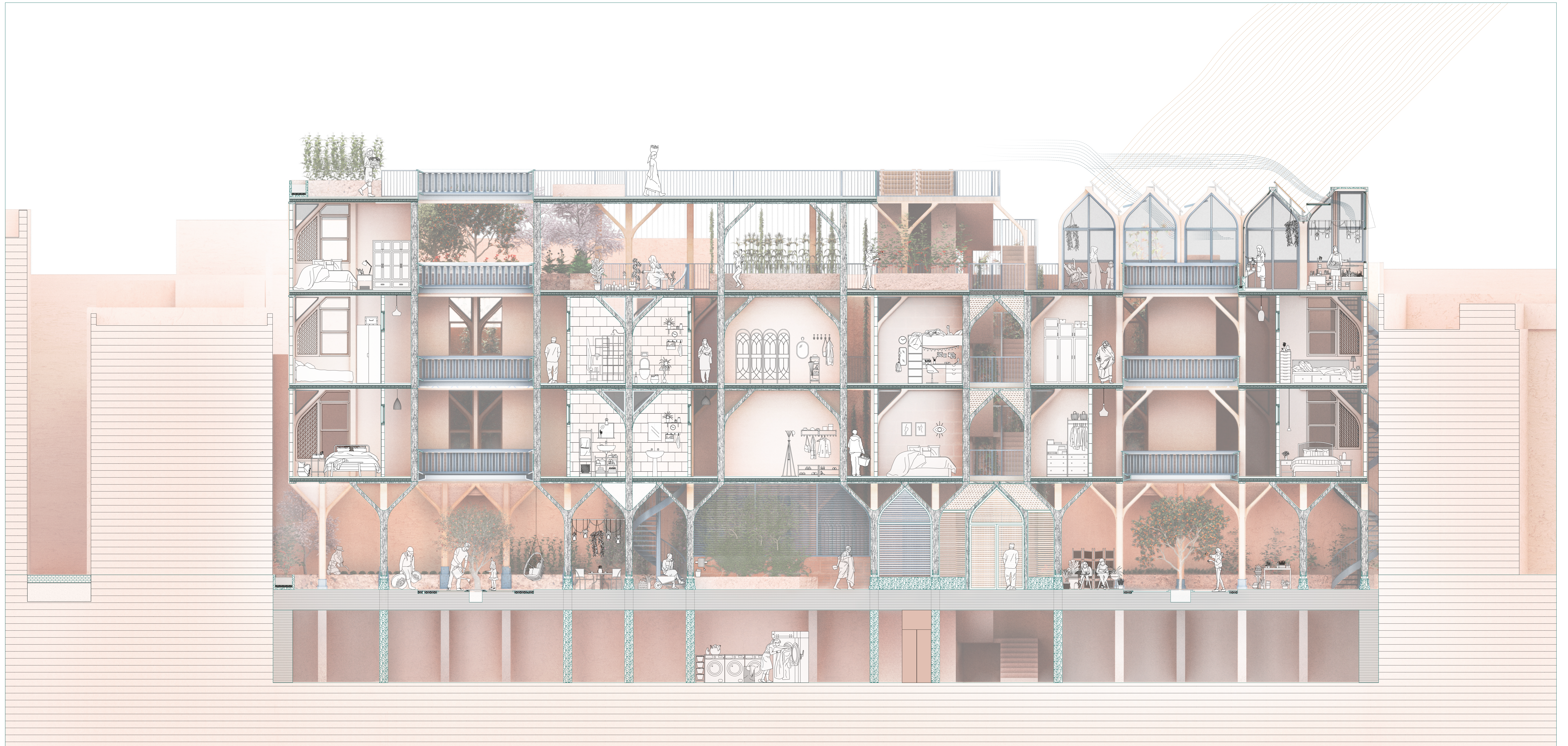
SECTION A SCALE 1/50