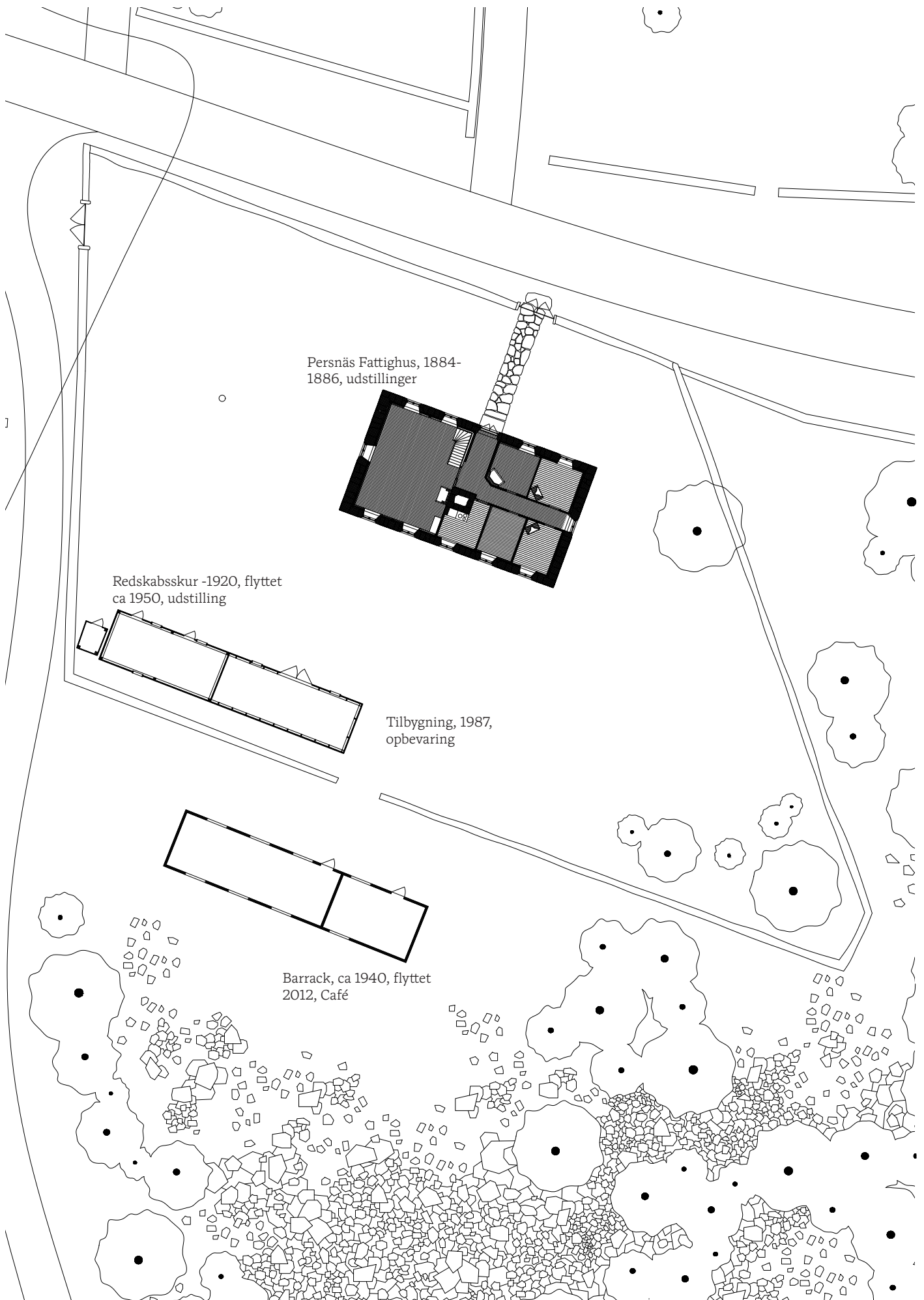
Bilaga 2. Eksisterende situationsplan. Egen illustration. 1:350