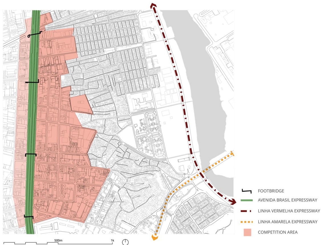
Figure 2: Competition site

These are the aspects that future architects and urbanists must consider so they may propose spatial concepts that add innovation to this set of social and cultural diversities. Emphasis must be given to the fact that there are no alternatives to deal with favelas without considering the spatial relationship with its surroundings and the formally built city.