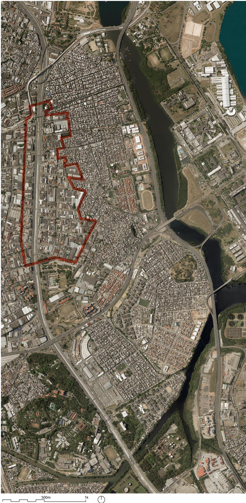
Figure 1: Outline of the project area.