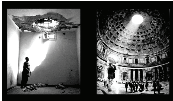
Workshop 5x5 2014, Damascus University